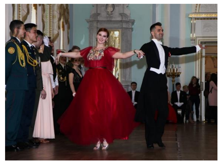
52.09.01 The Art of Choreography and Dance (specialisation in different types of dance)