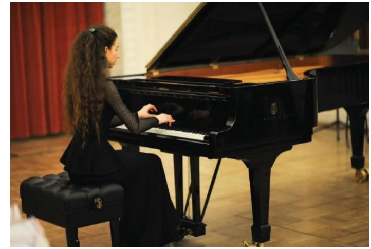
the prize winners, a graduate of the Herzen University Institute of Music, Theatre and Choreography.

The Museum of Music in the Sheremetev Palace in St Petersburg. The concert of the prize winners of the international competition 'St Petersburg in the Mirror of World Music Culture'. In the photo is one of