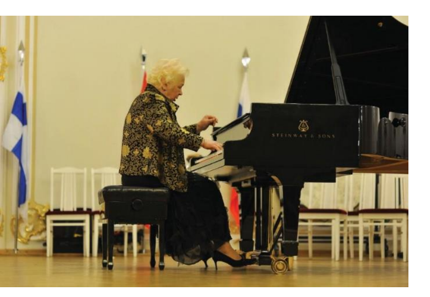
Prof. Ekaterina A. Murina, People's Performing Artist of Russia

The programme is rich in practice. Besides, it offers courses in teaching methods and techniques: solo piano performance, university-level repertoire (ensembles and concertmaster techniques), history and theory of piano performance, music styles of the 20<sup>th</sup> and 21<sup>st</sup> century, methods of teaching arts, music interpretation, etc.