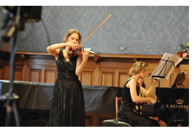
St Petersburg House of Composers. A concert of chamber music